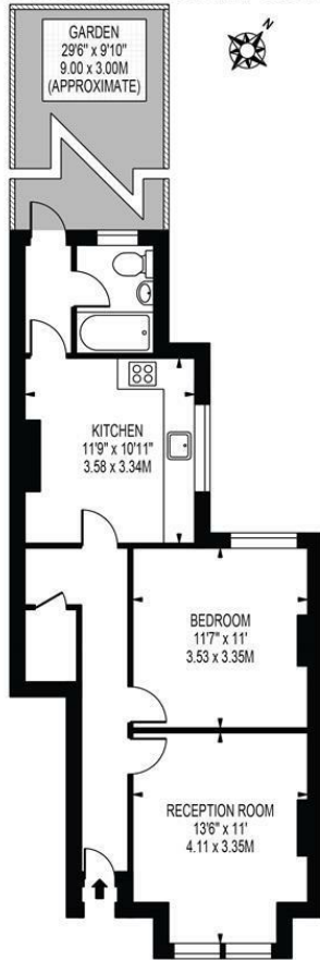
GROUND FLOOR FOR ILLUSTRATION PURPOSES ONLY

ACRE ROAD APPROXIMATE GROSS INTERNAL FLOOR AREA: 560 SQ FT - 52.01 SQ M